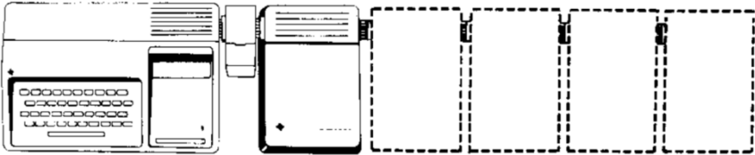
CONSOLE, SPEECH SYNTHESIZER, MEMORY EXPANSION UNIT, OTHER ACCESSORIES (CONNECTED IN ANY ORDER)